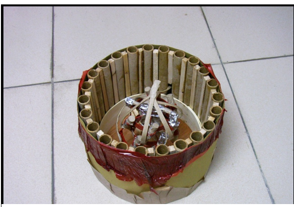
Internal View of Girandola with Spinner and Multiple Tubes

(Continued from page 1 column 3) Some of the primary provisions