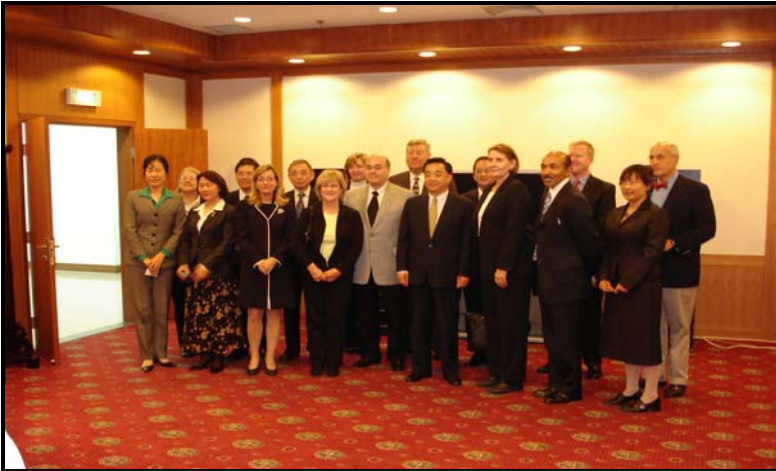
AFSL and CPSC delegation with AQSIIQ Vice Minister Ge at AQSIIQ Headquarters in Beijing.

couraged factories to continue to have all products certified through